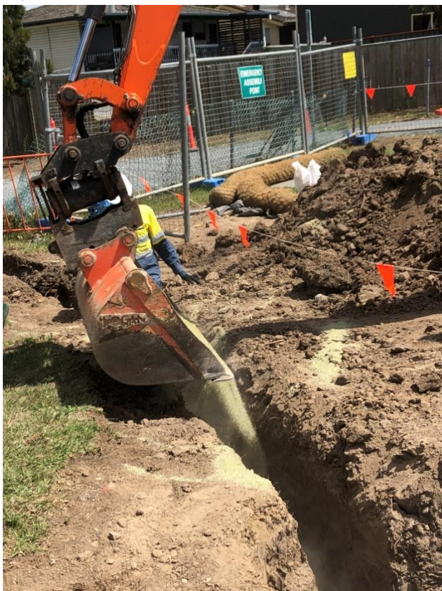
Figure 4.1: Construction of trench